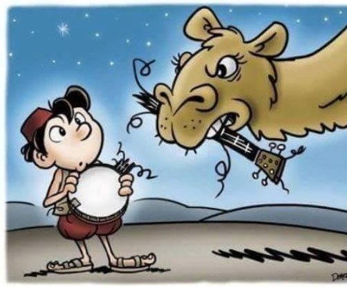
HOW THE LITTLE BANJO BOY BECAME A DRUMMER