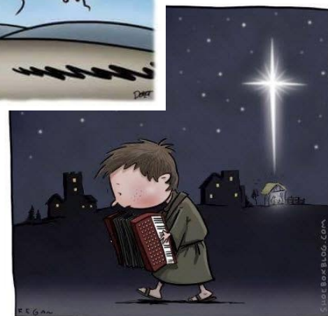
The little accordion boy was politely asked to go away that night.