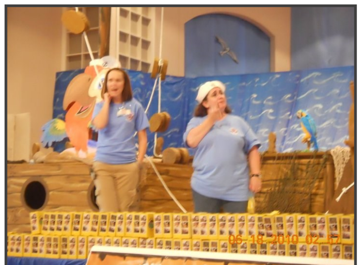
Probably thinking "what is my next line?" In this one, I ate thin onion rings and told her they were octopus. Gressed her out.