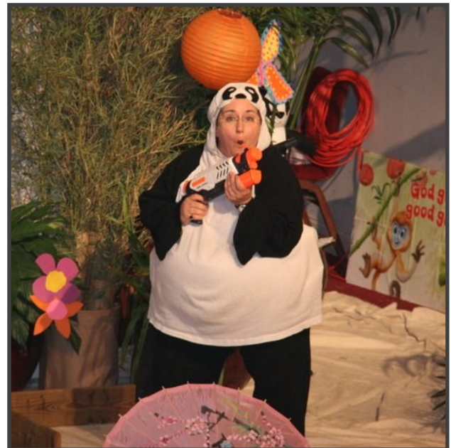
Yes, I shot a water gun at the kids.