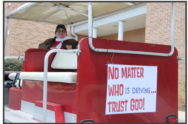
I could fit 12-15 kids on this bad boy!