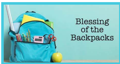
Blessing of the Backpacks

Youth and Adult classes will meet as usual.