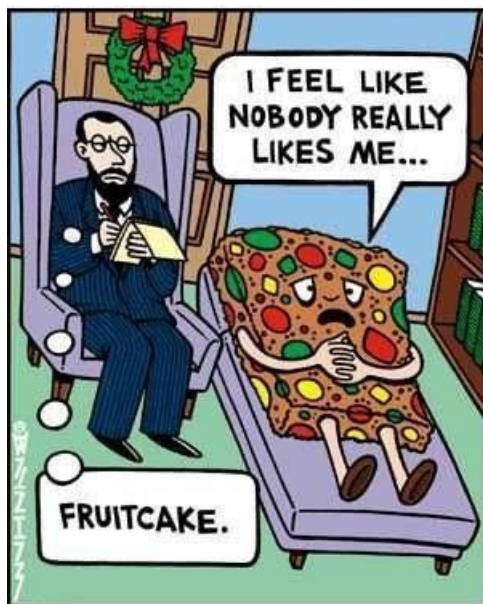
December 27—Fruitcake Day

Luke 7:23 ~ "Blessed are those who are not offended by me."