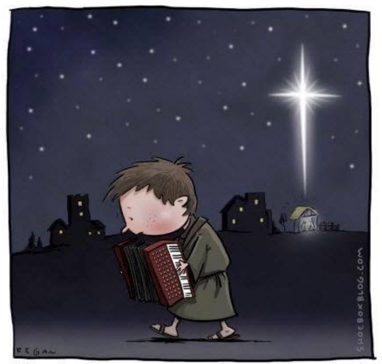
The little accordion boy was politely asked to go away that night.