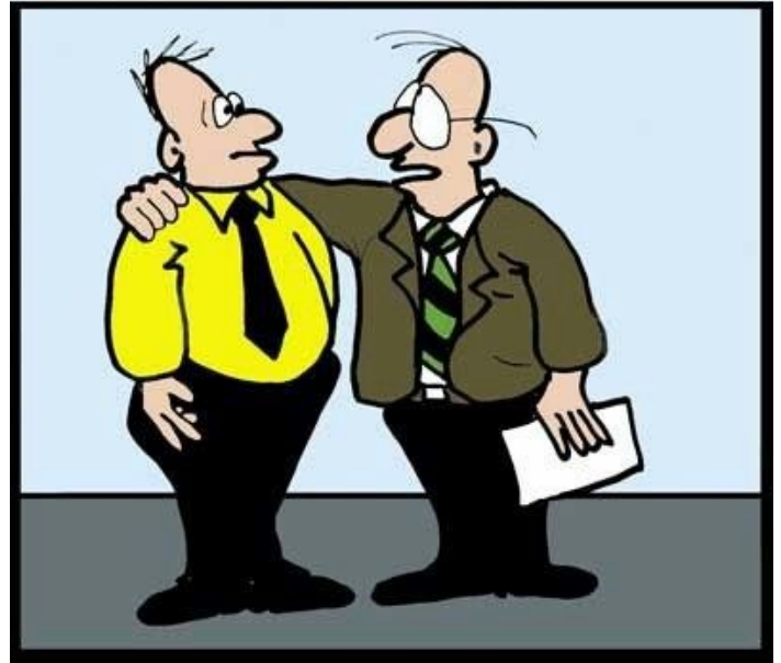
“You’re doing a good job as an usher, but its called an offering, not a sin tax.”