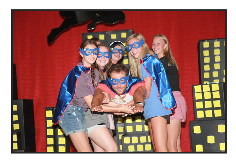
Youth & College Students were our super hero volunteers!